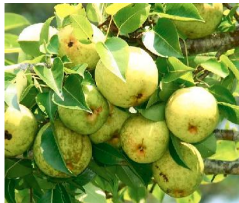
Chestnut Hill Farm Pears

1 cored and finely chopped pear/apple/orange, 2 cored and finely chopped kiwis, 2 tablespoons of honey and 1 teaspoon of lemon juice all gently tossed together and served with cinnamon graham crackers!